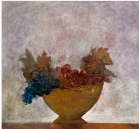
Fruit Bowl after Caravaggio, Oil on board, 65 x 60 cm