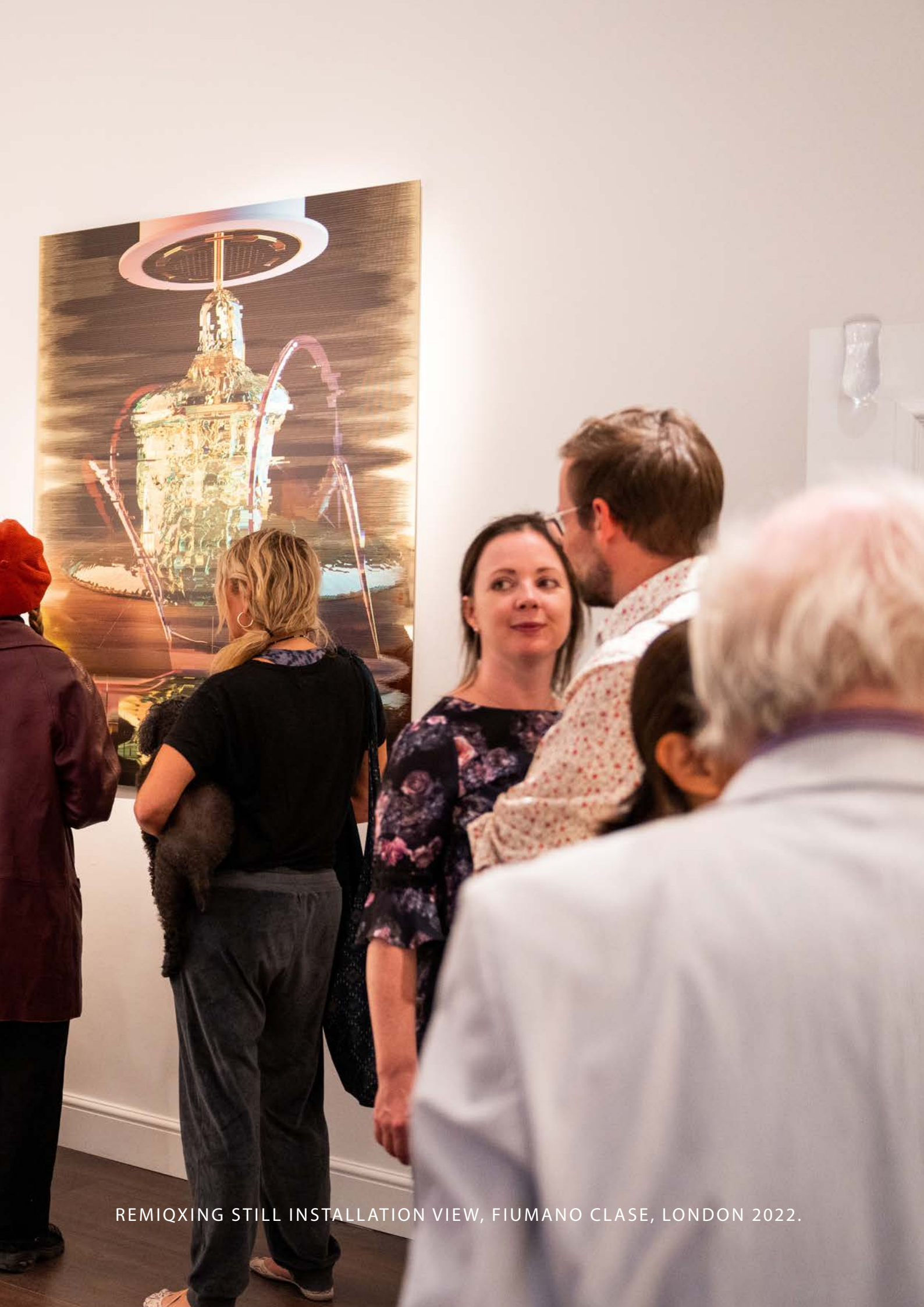
REMIQXING STILL INSTALLATION VIEW, FIUMANO CLASE, LONDON 2022.