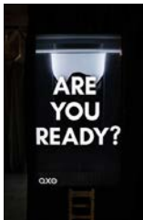
QX Extended Advertisement, 2022 5m57s single channel vertical video, no sound Variable Edition of 5 + 1AP & 1EP