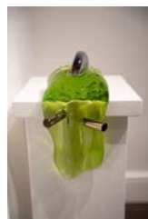
and it oozed out the machine, 2022 Hard-sculpted Glass 27 x 12 x 25.5 cm 10 5/8 x 4 3/4 x 10 in