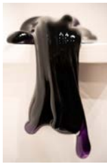
The slime has come , 2022 Hard-sculpted Glass 28 x 20 x 20 cm 11 x 7 7/8 x 7 7/8 in