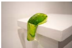
Cosmic killer slime, 2022

Hard-sculpted Glass 6.5 x 3.5 x 8 cm 2 1/2 x 1 3/8 x 3 1/8 in