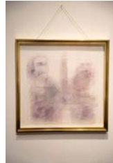
Bear twin worm tentacle (quantum hybrid), 2022 C-type print of scanned watercolour painting manipulated by bespoke quantum computer code on clear acrylic with gold aluminium frame 38 x 38 cm 15 x 15 in