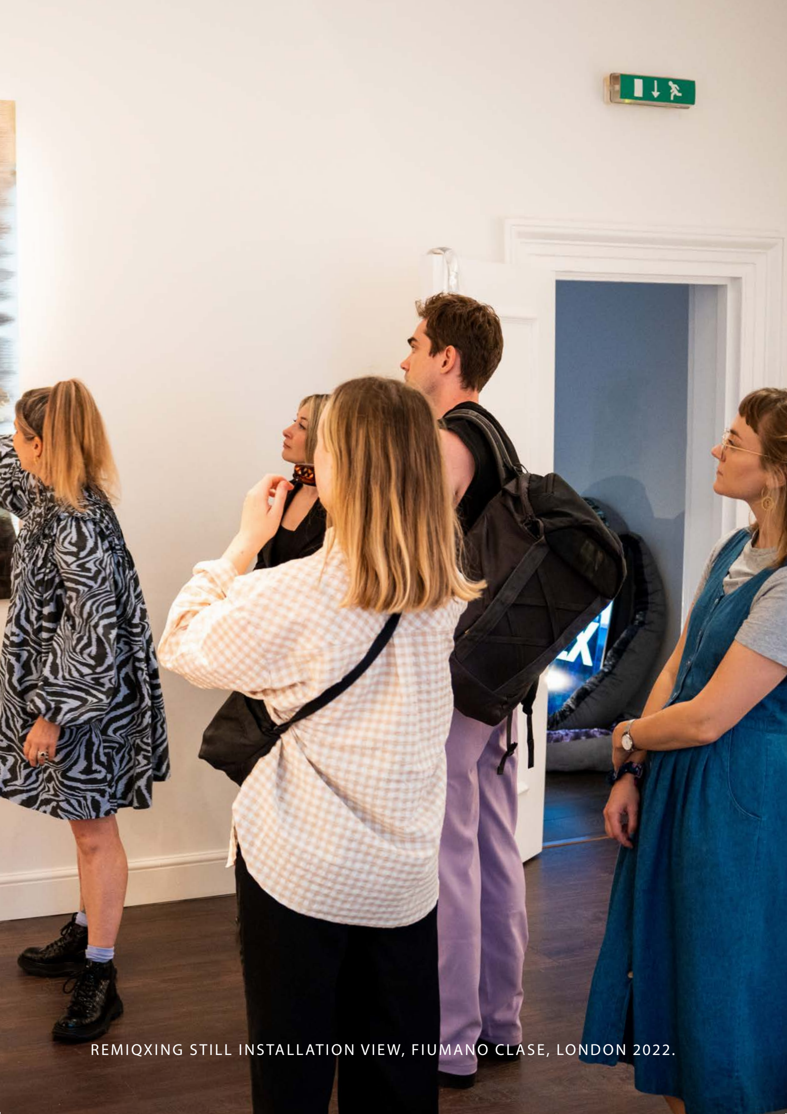
REMIQXING STILL INSTALLATION VIEW, FIUMANO CLASE, LONDON 2022.