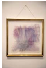
Bat hand blob wing (quantum hybrid), 2022 C-type print of scanned watercolour painting manipulated by bespoke quantum computer code on clear acrylic with gold aluminium frame 38 x 38 cm 15 x 15 in