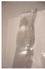
Omnipresent slime, 2022 Hard-sculpted glass 15 x 7 x 14 cm 5 7/8 x 2 3/4 x 5 1/2 in