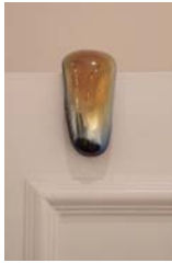
Slime matters, 2022 Hard-sculpted Glass 14 x 7.5 x 13.5 cm 5 1/2 x 3 x 5 1/4 in