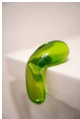
Kin slime, 2022

C-type print with glitches created by bespoke quantum computer code on gold coloured Dibond aluminium 150 x 100 cm 59 x 39 3/8 in