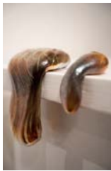
Primordial slime, 2022 Hard-sculpted Glass Small: 7 x 4 x 7cm Large: 13 x 9 x 8 cm