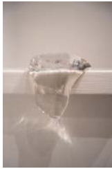
Better luck next slime, 2022

Hard-sculpted Glass 11 x 9 x 9 cm 4 3/8 x 3 1/2 x 3 1/2 in