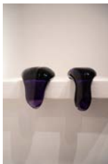
Sticky entanglements , 2022 Hard-sculpted Glass Small: 8 x 5.5 x 8 cm Large 7 x 6.5 x 8 cm