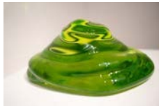
Pt 2 of Slime teetering on the edge between life and death, 2022 Hard-sculpted Glass Small: 7.5 x 3.5 x 6.5 cm Large 10 x 21.5 x 15 cm