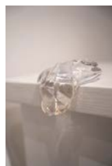
Mucus unfurling, 2022 Hard-sculpted Glass 6.5 x 8.5 x 10 cm 2 1/2 x 3 3/8 x 4 in