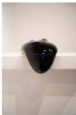
Jellyfish out of water , 2022 Hard-sculpted Glass 8 x 8.5 x 12 cm 3 1/8 x 3 3/8 x 4 3/4 in