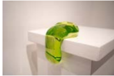
Jekyll & Slime, 2022 Hard-sculpted glass 11 x 8.5 x 11 cm 4 3/8 x 3 3/8 x 4 3/8 in