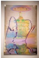
Potential - light, 2022

C-type print with glitches created by bespoke quantum computer code on gold coloured Dibond aluminium 40 x 60 cm 15 3/4 x 23 5/8 in