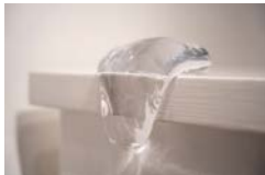
Slime flies when you're having fun, 2022

Hard-sculpted Glass 11 x 9 x 9 cm 4 3/8 x 3 1/2 x 3 1/2 in