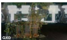
QX Product Launch , 2022 4m30s single channel video with sound. Variable Edition of 5 + 1AP & 1EP