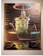
Potential - dark, 2022 C-type print with glitches created by bespoke quantum computer code on gold coloured Dibond aluminium 150 x 120 cm 59 x 47 1/4 in