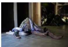
Tentacle Tangle , 2022 Sculptural seating Suede, velvet, c-type printed satin Each tentacle is 3m, 7 tentacles and a 1m central core Edition of 3 plus 1AP & 1 EP