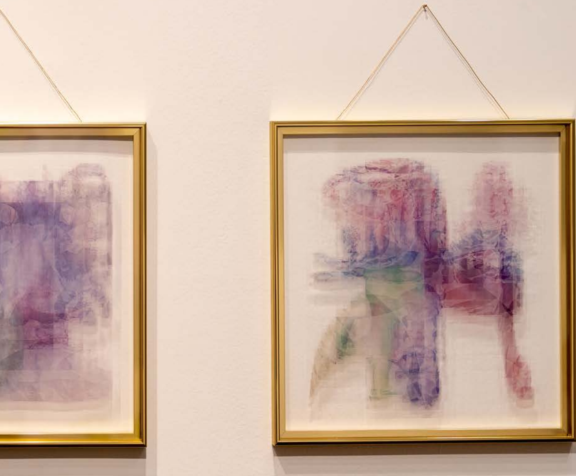
REMIQXING STILL INSTALLATION VIEW, FIUMANO CLASE, LONDON 2022.