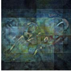
Cephalopod Alien - quantum deconstruction , 2022 c-type print on Fuji gloss 30 x 30 cm 11 3/4 x 11 3/4 in Edition of 10 + 2APs