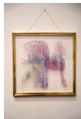
Pink slime mould hand (quantum hybrid), 2022 C-type print of scanned watercolour painting manipulated by bespoke quantum computer code on clear acrylic with gold aluminium frame 38 x 38 cm 15 x 15 in