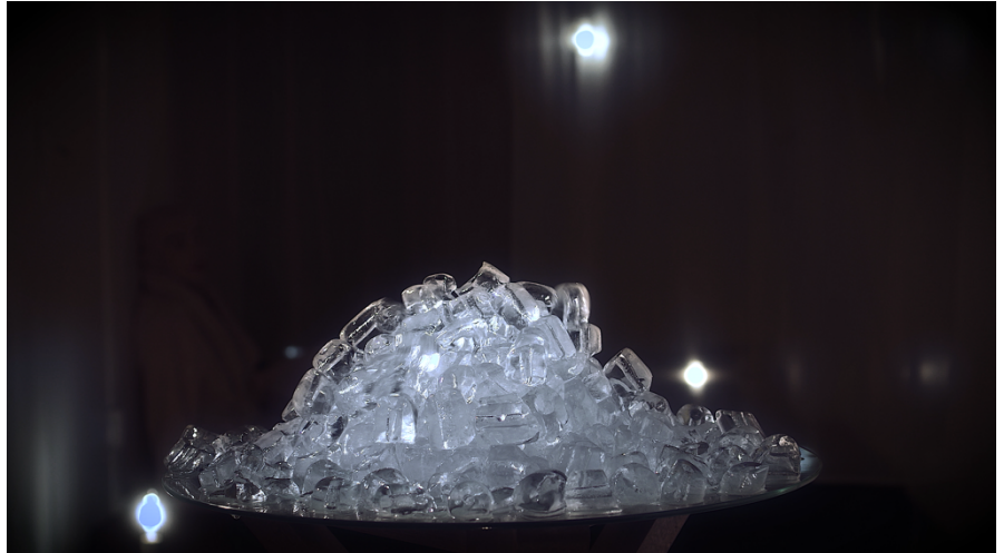
Stuart Laws, 'Lapsed' (still), 2019, 5 minutes, limited edition of 3, Edition 1: £175 A time-lapse video piece exploring climate change