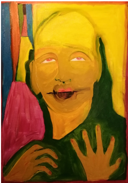
Jessica Hynes, All the single ladies! , acrylic on canvas, 60 x 42 cm, 2019, £600