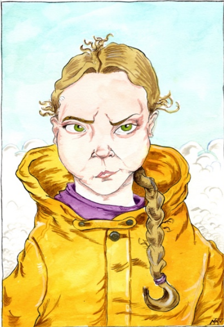
Tom Neenan, Greta , watercolour and ink on paper, 29.7 x 21 cm, 2019, £150

This exhibition is a celebration of creativity, revealing the artistic talent behind some of comedy industry's best-known faces.